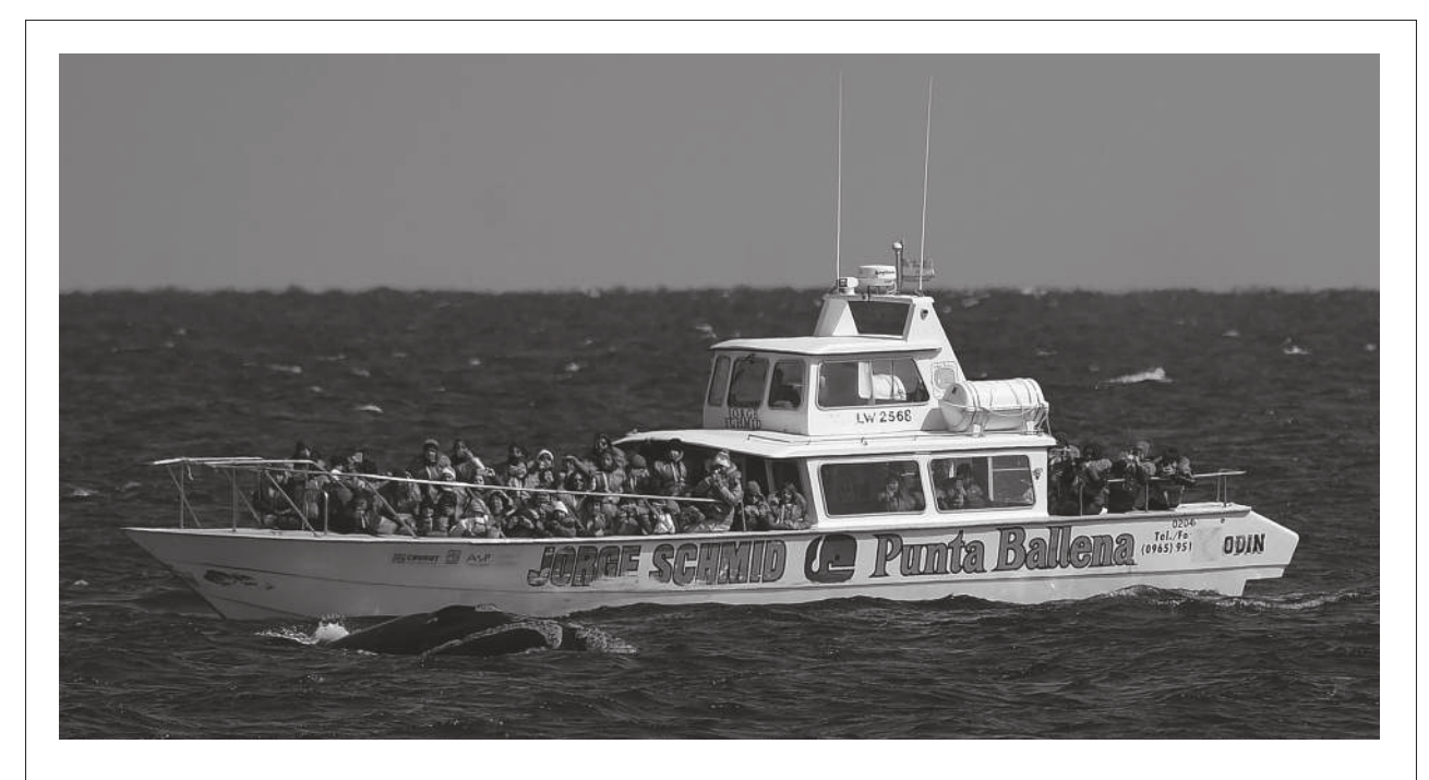
Fig. 3 for Question 3

Wildlife tours are popular with tourists. The photograph above shows a whale watching tour in Argentina.